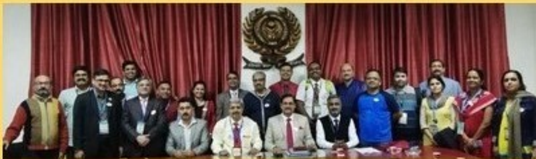
ISPPD Office Bearers and EC members at EC meeting held on 14-02-2019 during Pedopanacea, Meerut.